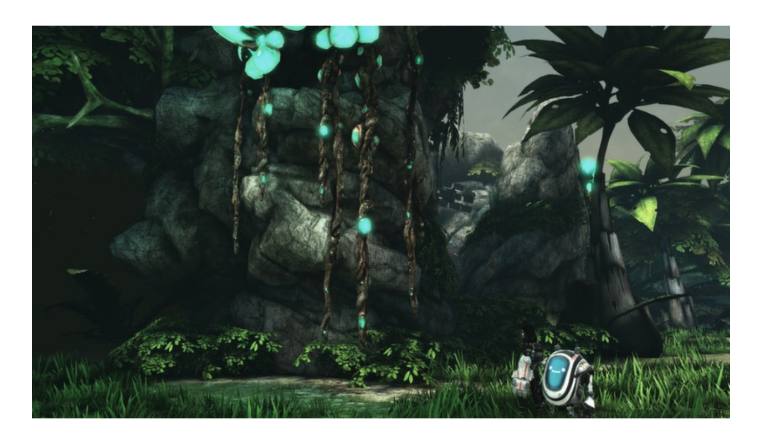
Sanctum 2: Road To Elysion Download For Pc Ocean Of Games